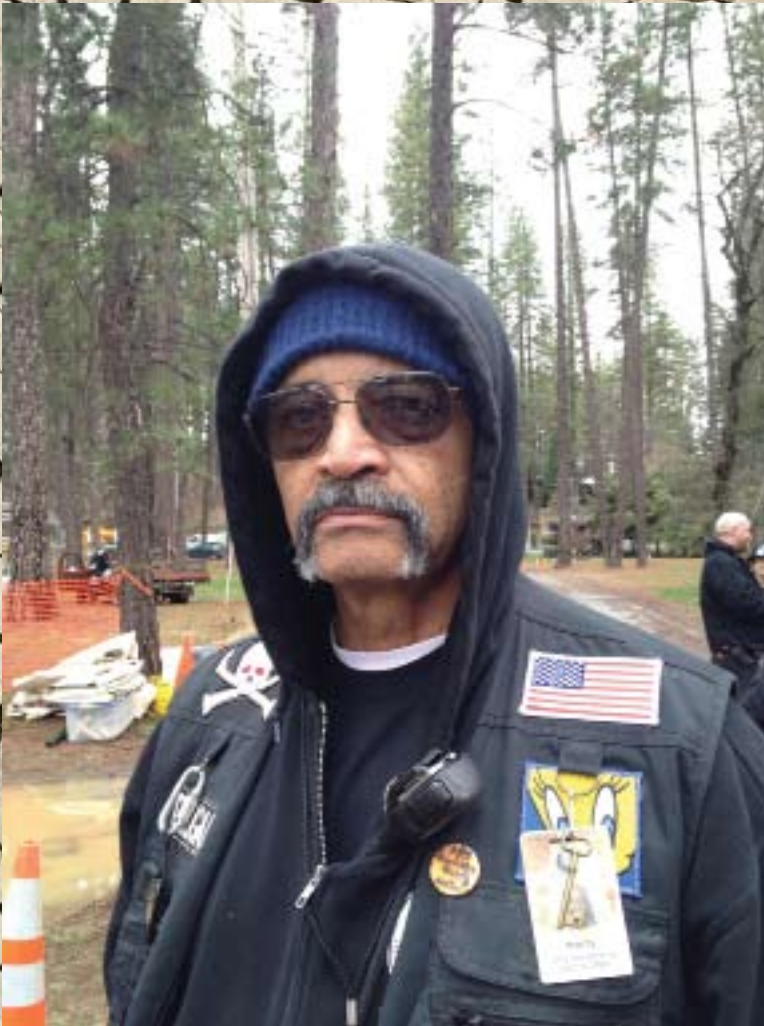
Looney Tunes (Marty)